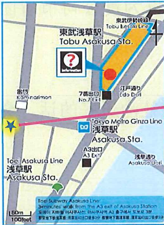
MAP of Tobu Asakusa Station Yard